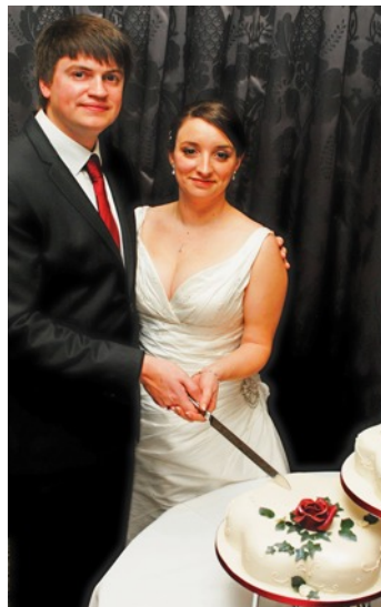
The cutting of the wedding cake

This newshound is not yet privy to the future plans for the happy couple save that they were intending to stay at home for Christmas. Whatever their future holds for them I trust I am merely echoing the good thoughts and best wishes of all their friends and acting colleagues in Riverside Players when I wish them both every happiness for the future. Mind you! I still think it is something in the water at Richmond Hall. Who will be next?